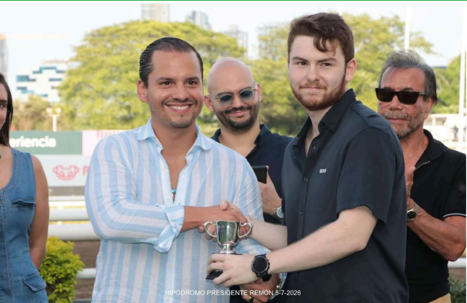
HIPÓDROMO PRESIDENTE REMÓN 5-7-2026