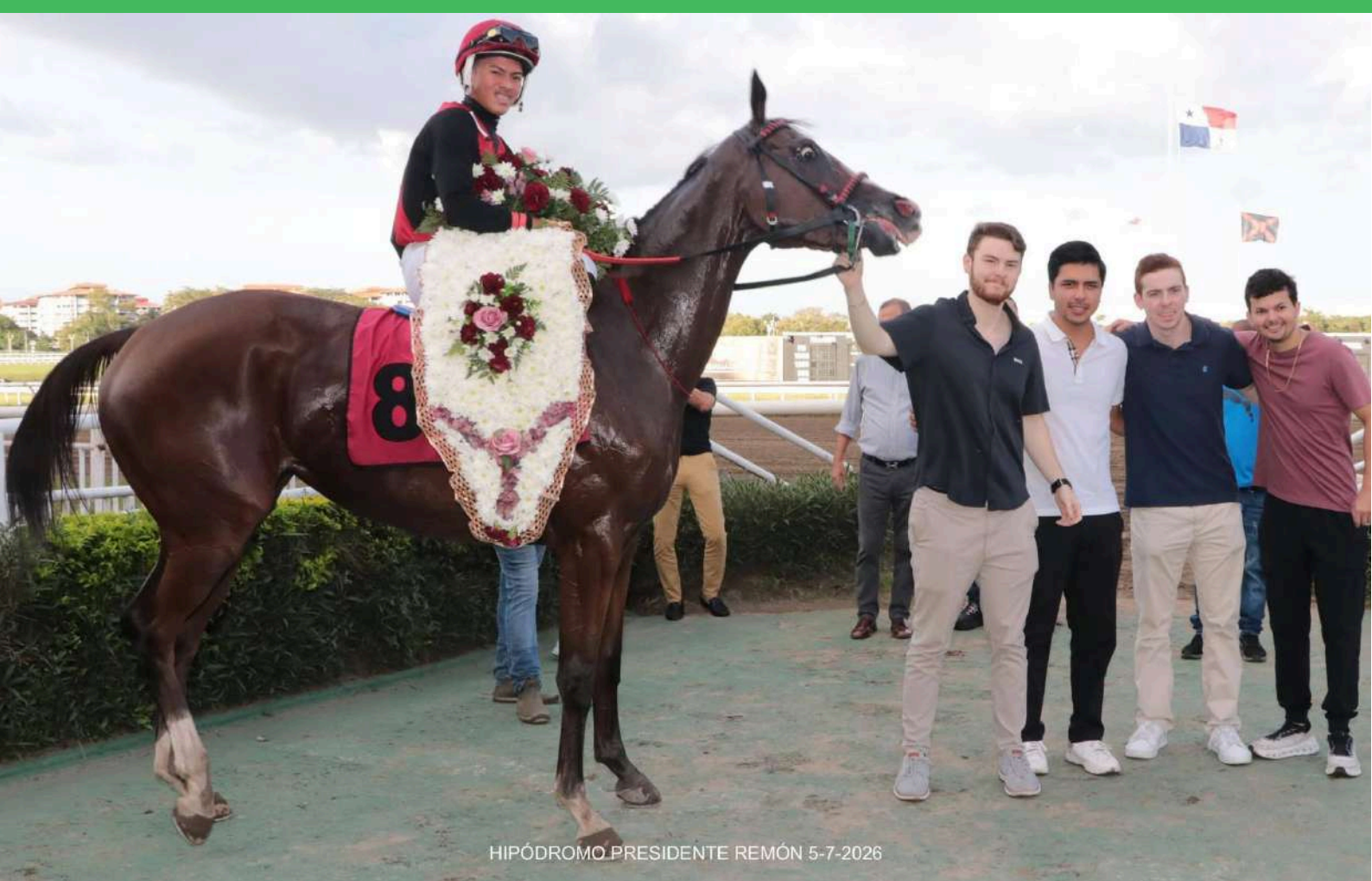
HIPÓDROMO PRESIDENTE REMÓN 5-7-2026